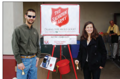
Dec. 15 at Brookshire's on Rice Rd.