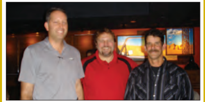
Builders' Luncheon Dec. 15, 2011 - Thank you to luncheon sponsor, Assured Insulating! All builders receive an email and a recorded phone reminder of the next Luncheon.