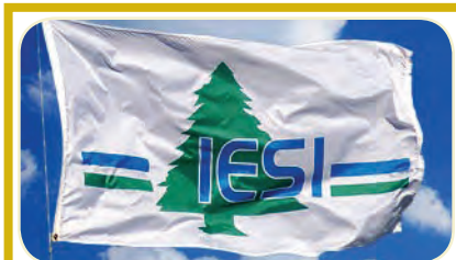
Builders' Luncheon Jan. 12, 2012 Thanks to IESI for sponsoring the luncheon at Spring Creek Barbecue.

Stonebridge Heating & A/C Texas National Bank Thedford Construction Co., Inc. Wells Marble Co. Wright-Way Solar Technologies