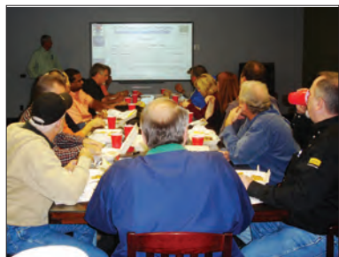
City Lunch & Learn - TABA builder members attended this quarterly event on Nov. 9, 2011.