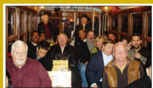
2012 Board Retreat in Dallas

PRESORT STANDARD US POSTAGE PAID TYLER TX PERMIT NO 157