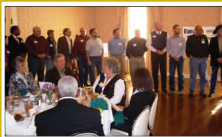
2012 Board of Directors