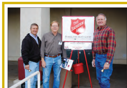
Thanks to all our volunteer Bell Ringers!

Coming in the April issue of TABA News . Be present at After Hours on March 6 for your chance to win the Associate Member drawing and have your business spotlighted here!