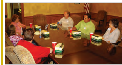
Orientation September 22, 2011

advertising and marketing and much, much more.