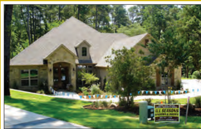
2011 Parade home

final contract submittal date is Feb. 15, 2012 at 4 p.m. All TABA builders are eligible to participate. The event runs June 2-10. Download the contract from the Members Only page at www.tylerearebuilders.com . Stay abreast of everything related to this premier Tyler event on the site's Parade page.