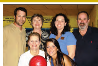
Bowling with Builders 2011 - Don't miss one of the most popular events of the year!

Lane sponsorships are available to all members — get your company name in front of this great crowd of competitors!