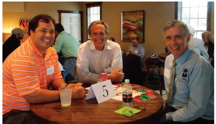
Thanks to all of our Associate & Builder members who participated in Speed Networking!